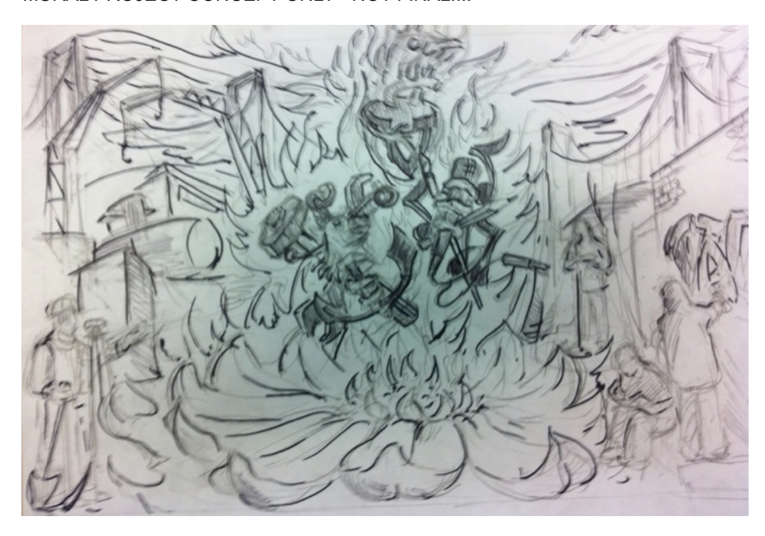
FINAL DESIGN TO BE SHOWN SOON!